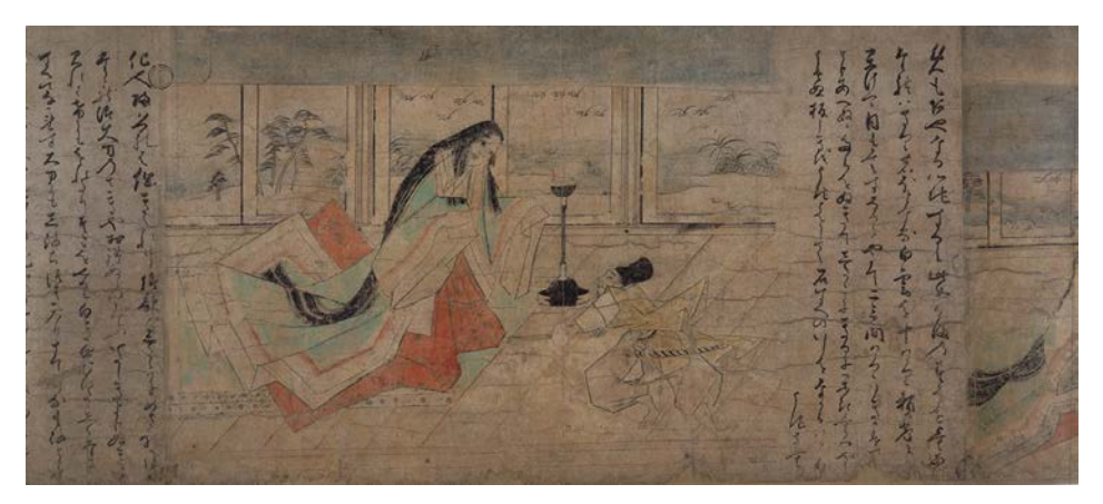
FIGURE 6. Raikō strikes the beautiful woman.