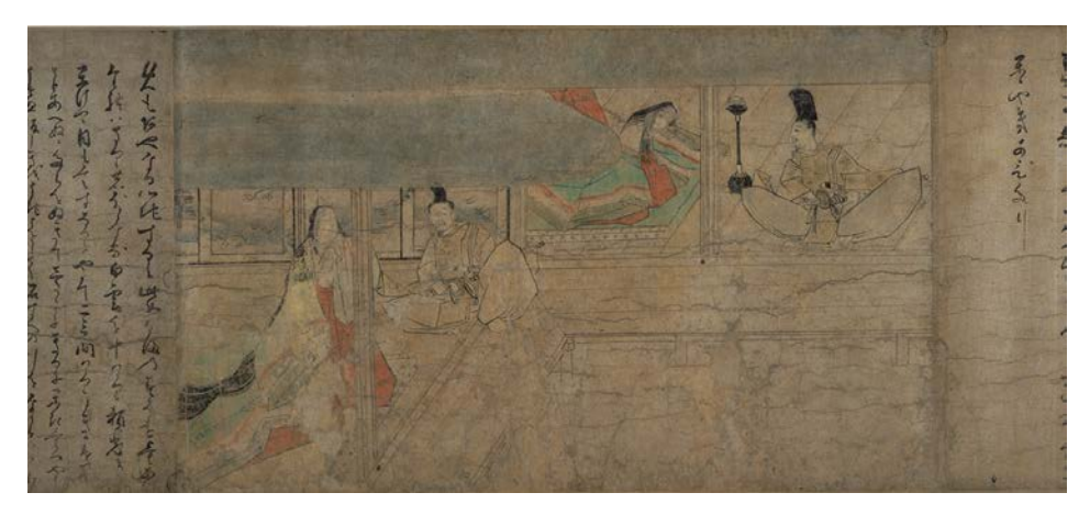
FIGURE 5. A woman of striking beauty pays a visit to Raiko.

Buddha image. To Raikō's consternation, the creatures suddenly burst out laughing and left, closing the sliding door behind them.