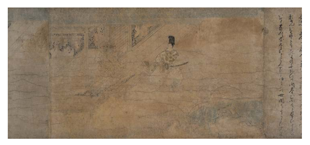
FIGURE 2. Raikō meets an old woman.