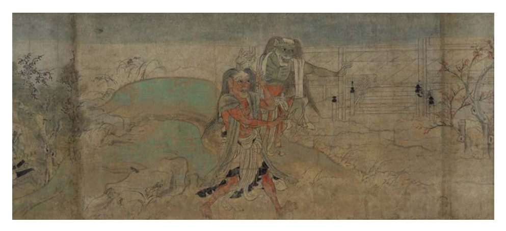
FIGURE 8. A gigantic creature with numerous legs (or two oni?) challenges them to a fight.