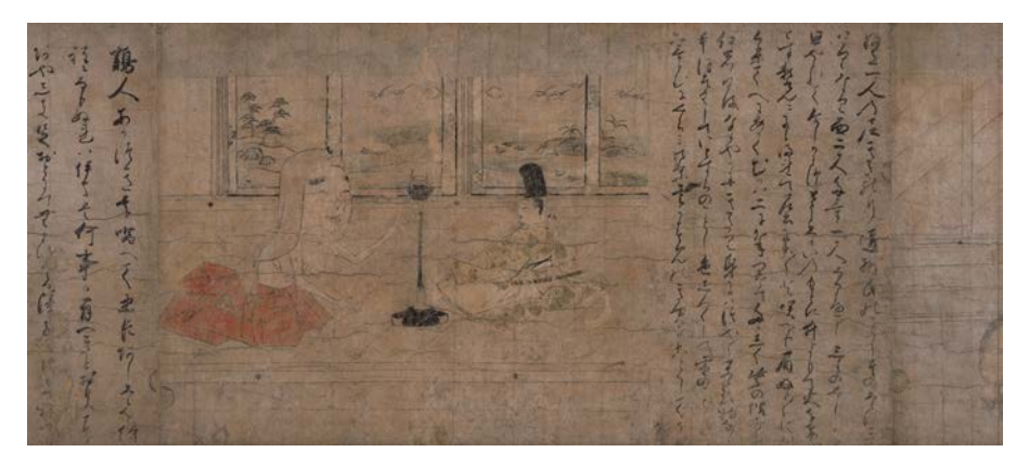
FIGURE 4. A small woman with a big head smiles at Raiko.

This place is a demons' [den];<sup>25</sup> no human dares pass through our gates. My sorrowful youth has gone, but my old self sadly remains. I lament that bush warblers depart and swallows on the beam fly off.<sup>26</sup> To meet you here is like a singing girl of Ch'ang-an 長安 meeting Po Chü-i in the Yuan-ho era 元和.<sup>27</sup> People and places may be different, but the sentiment is the same. Over there whenever the singing girl saw the moonlight reflected on the river, she wept tears.<sup>28</sup> I see that I have met a wise man at last. Please kill me. I wish to pray for Amida Bud-dha ten times and look for the coming of three Buddhas.<sup>29</sup> There could be no better favor than this."