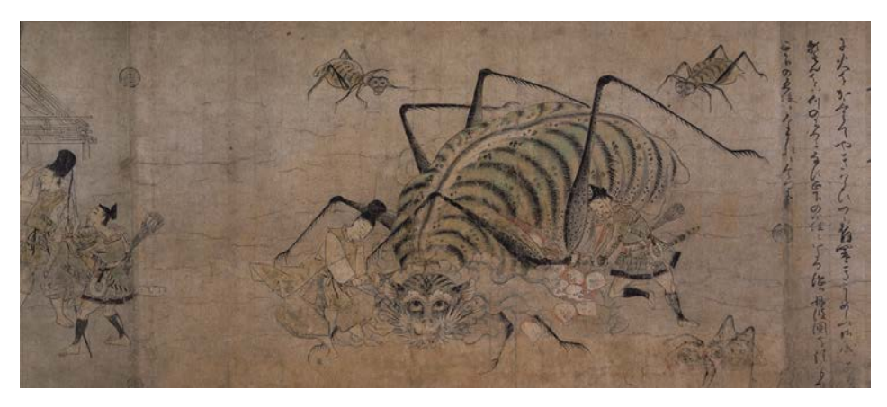
FIGURE 9. Raiko and Tsuna kill the monstrous spider.

warrior sworn to protect the emperor, and his compatriot, sworn to help him rule the country. How can you disobey?