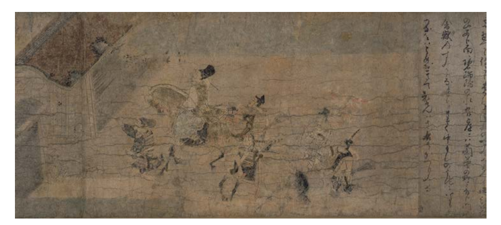
FIGURE I. Raikō and Tsuna enter the dilapidated mansion.