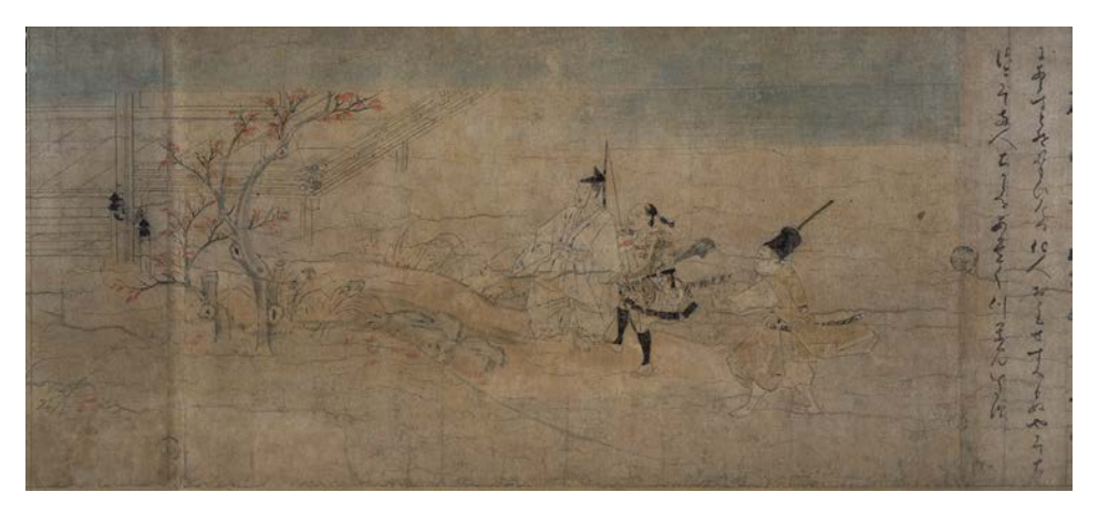
FIGURE 7. Raikō and Tsuna proceed with an effigy as their shield.