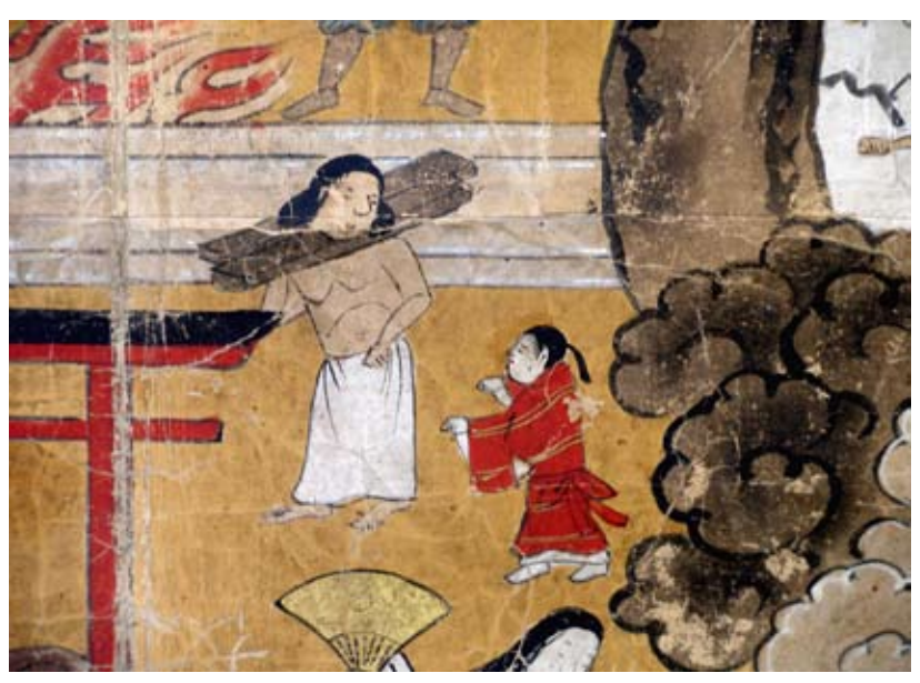
FIGURE 7: A mother and her child beside the animal realm. From the Formanek Kumano Mind Contemplation Ten Worlds Mandala (seventeenth century). Private collection, Vienna.