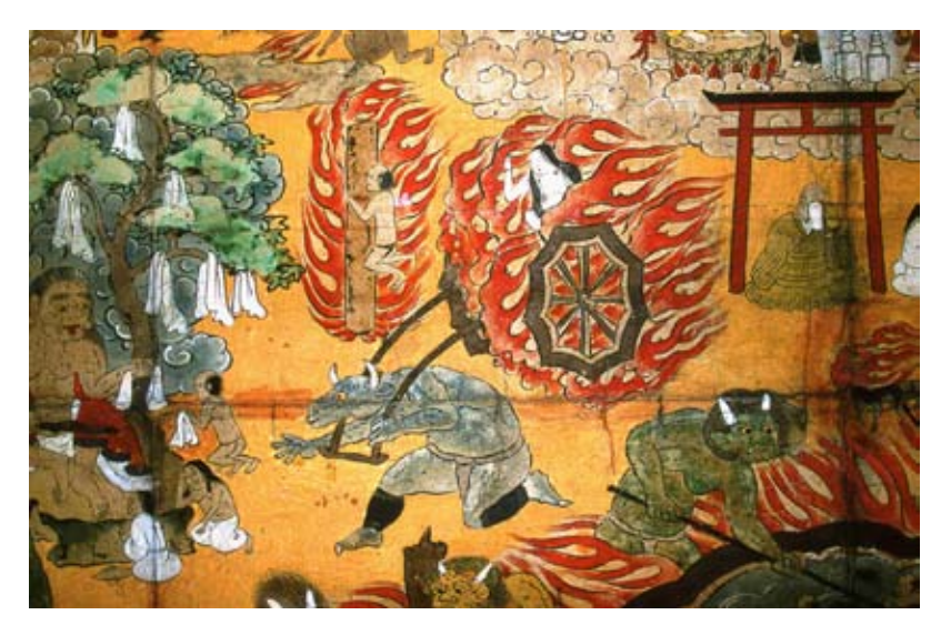
FIGURE 4: A horse-headed demon ( mezu 馬頭) pulling a sinner in a burning cart. From the Hyōgo Kumano Mind Contemplation Ten Worlds Mandala (seventeenth century).