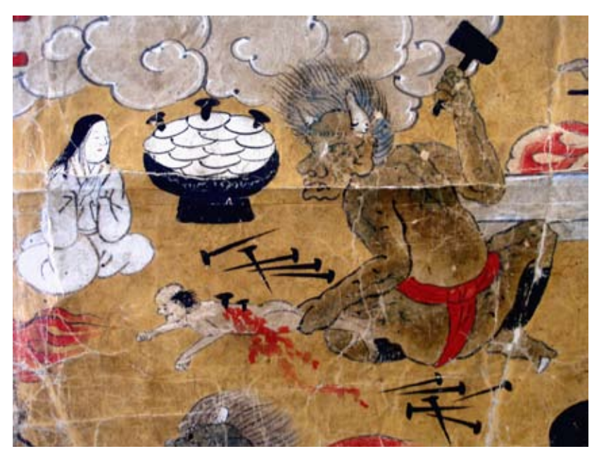
FIGURE 5: A bestial demon torturing a sinner in hell. From the Formanek Kumano Mind Contemplation Ten Worlds Mandala (seventeenth century). Private collection, Vienna.