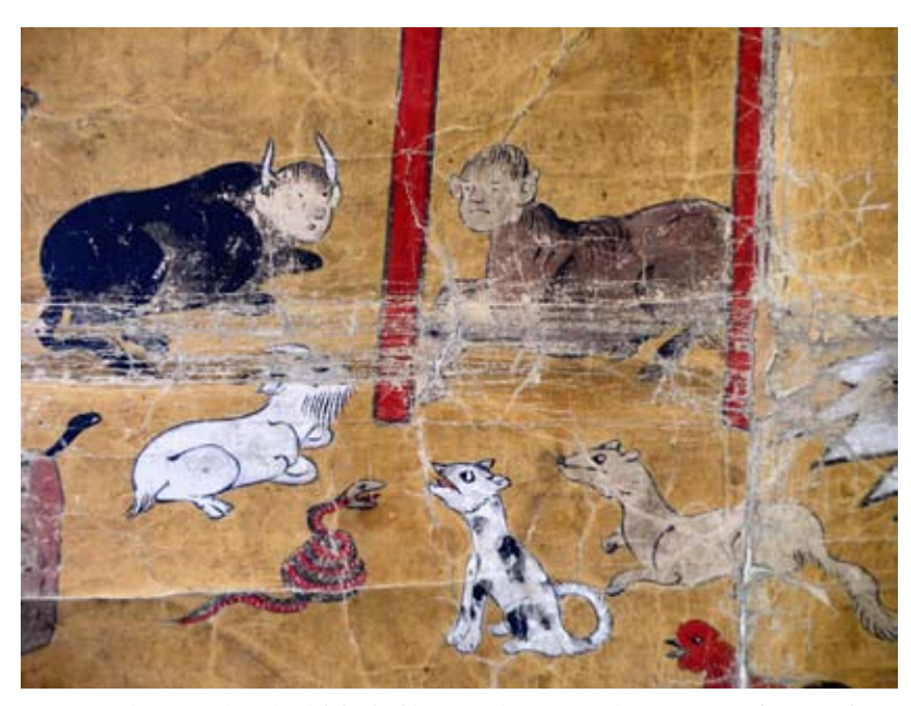
FIGURE 3: The Animal Realm ( chikush\bar{o}d\bar{o} ). From the Formanek Kumano Mind Contemplation Ten Worlds Mandala (seventeenth century). Private collection, Vienna.