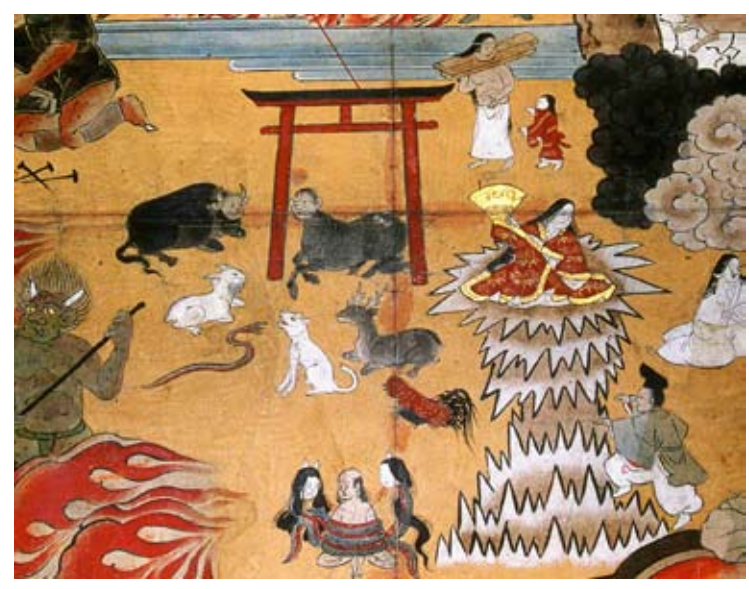
FIGURE 2: The Animal Realm (chikushōdō 畜生道). From the Hyōgo Kumano Mind Contemplation Ten Worlds Mandala (seventeenth century).