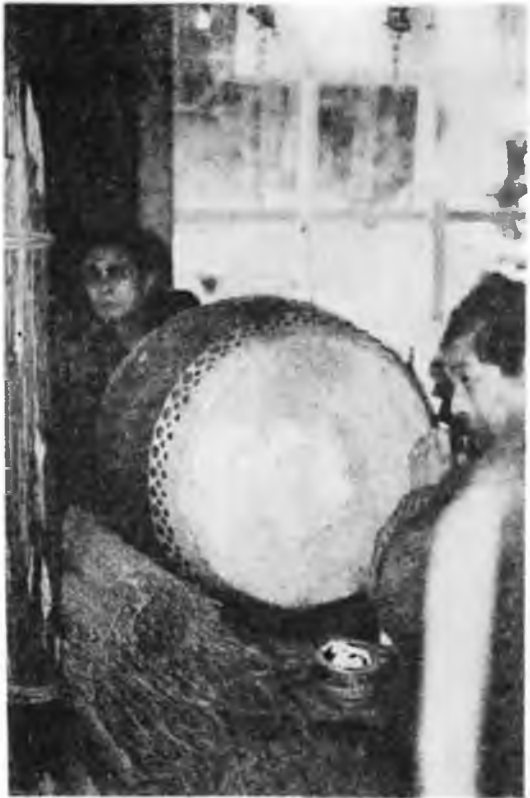
Fig. 5. Drum and flute players. Note also the straw mat beside the drum which is placed near the kama for the significant dances.