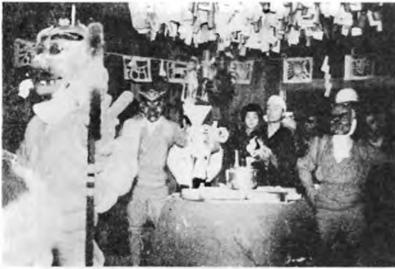
Fig. 7. The Yamawari oni and two of his assistants around the kama with the torch-bearer among the assistants.