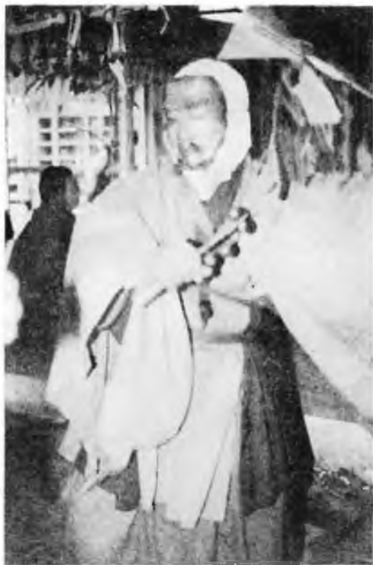
Fig. 12. The Hino neqi with a five-colored gohei.