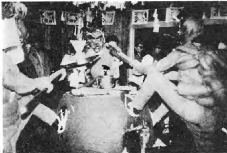
Fig. 8. Yamawari oni and his assistants performing the 'cutting of the mountain' rite.