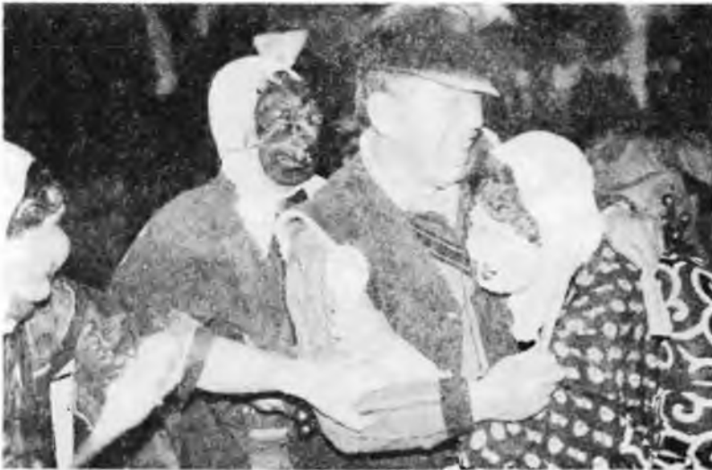
Fig. 10. The Okame and a Hyottoko clown with a member of the audience.