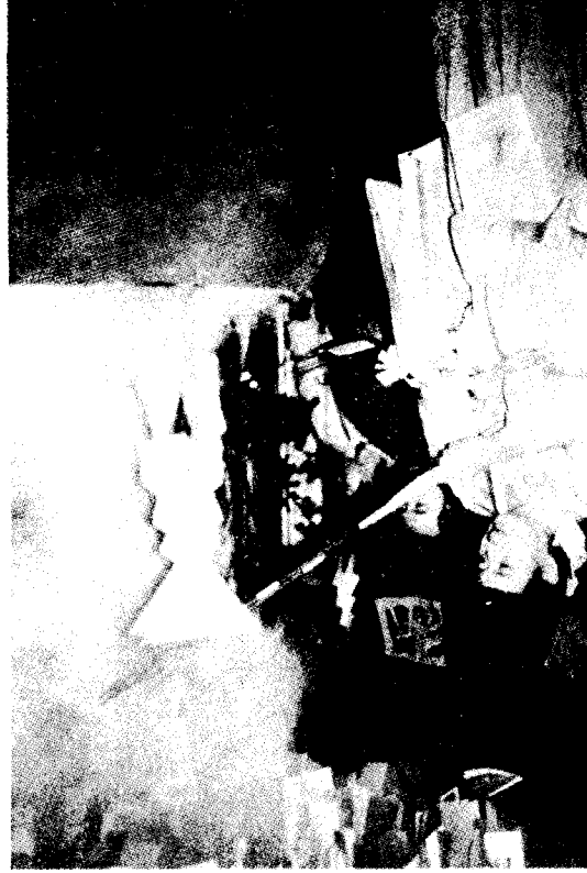
Fig. 3. Yudate rite performed by the Hana daiyu while his assistant holds other ritual instruments.