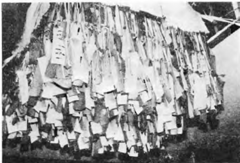
Fig. 1. Yubuta , the canopy above the kama (stove).

7. The hitokatabei is another ritual item directly related to the Yamabushi ceremony of Shōkanjō. See Kita Shitara Hanamatsuri Hozonkai 1981: 9 and Haga 1977: 81.