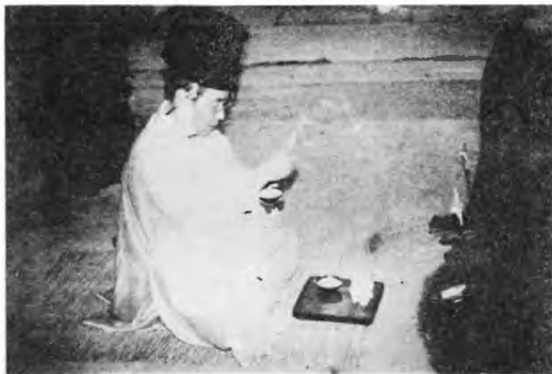
Fig. 2. Hana daiyu sprinkling salt in the four directions during the rite of Kama barai .