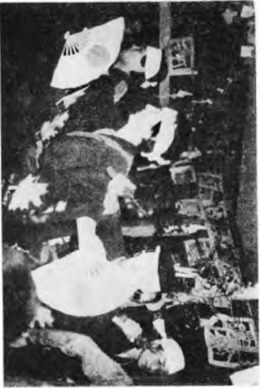
Fig. 6. An Ichibiki hana no mai team performing a dedication dance.