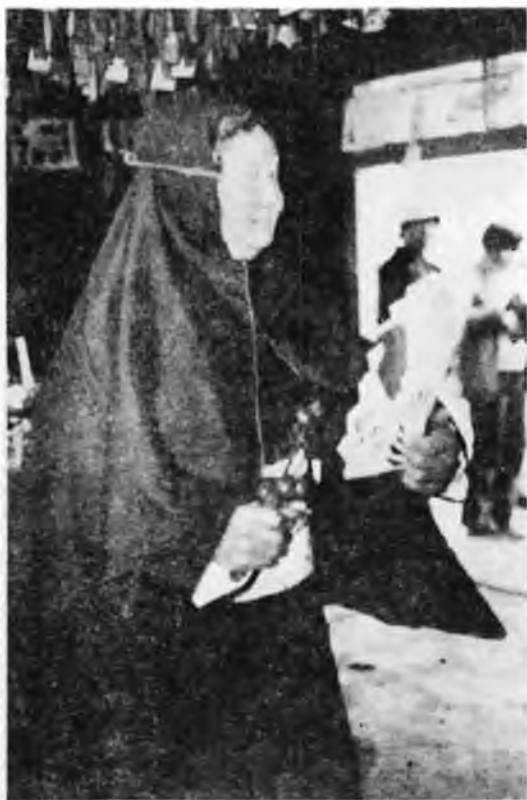
Fig. 11. The Miko silently dances near the kama.