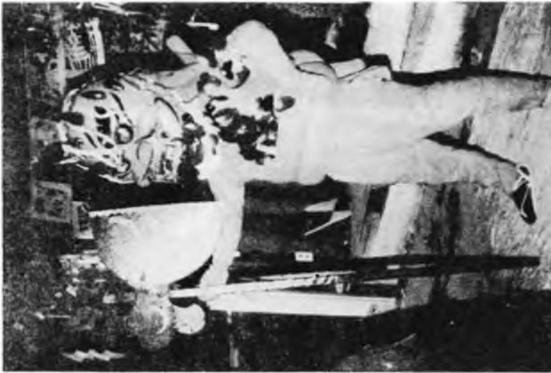
Fig. 9. The Sakaki oni postures near the kama.