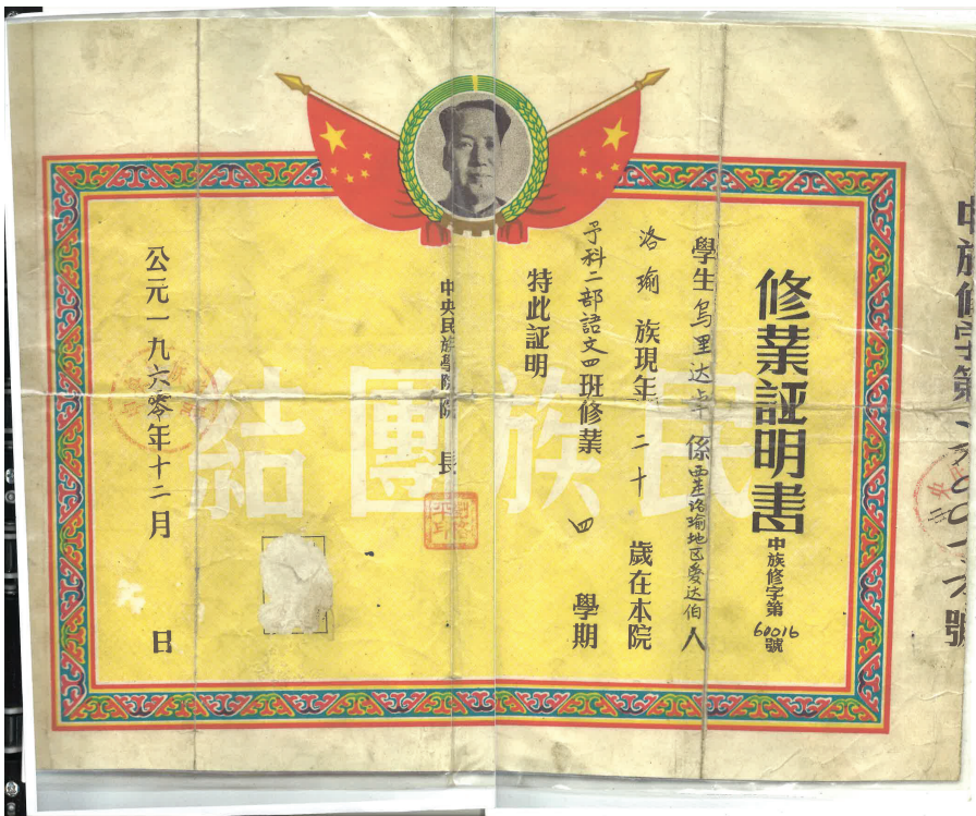
FIGURE 3: Certificate of “ethnic harmony” issued by the Government of China

“If we don’t go to hunt, the Chinese will end up at our doorsteps. Our going to the borders is a way to check on the Chinese intruders.” Mishmi hunters claim that they are protecting not only the nation’s boundary but also protecting wildlife from Chinese hunters. “Chinese 19 hunt everything, they come with AK-47s and advanced weapons, they don’t spare any animal or bird,” the hunters asserted, citing examples of how Mishmi follow taboos so they do not hunt every animal that comes their way but the Chinese hunt indiscriminately. The reliance of the Indian military and paramilitary on Mishmi knowledge gives the hunters a sense of importance, so they take pride in this. Similarly, Mishmi knowledge of the wildlife and the trails up in the mountains make wildlife researchers completely dependent on the Mishmi.