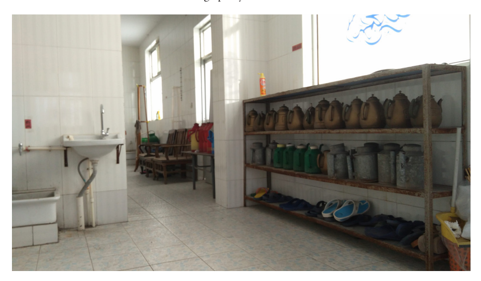
Figure 2: Plastic and metal pitchers in the washhouse of Zibo Mosque, Shandong Province.