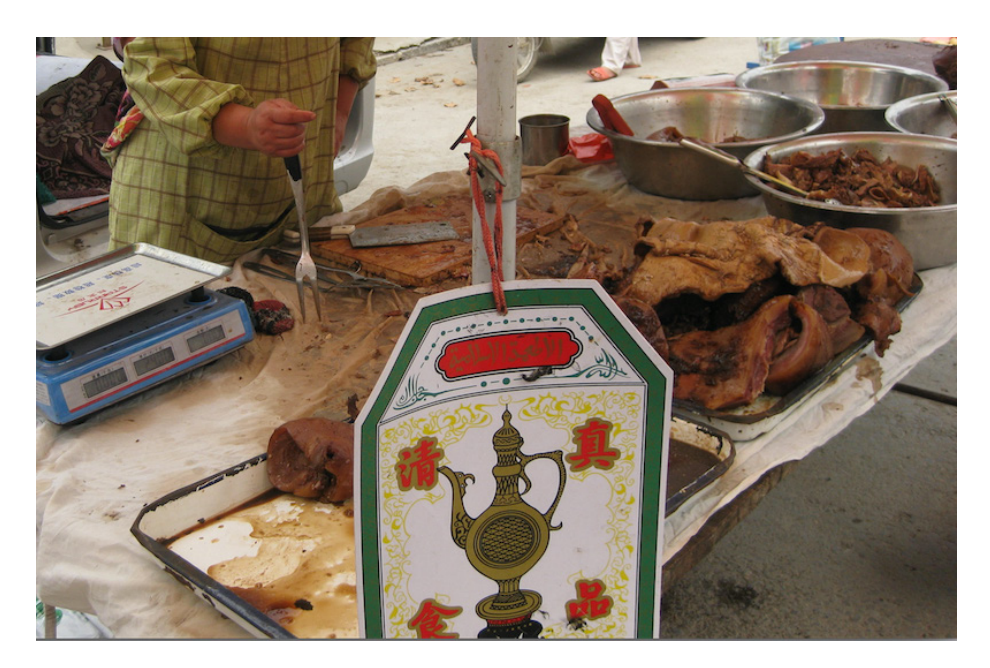
Figure 3: A paper pitcher-sign on a beef stall. The Chinese characters on the paper board read "halal food."

sic character of being a sign is not discernible until it is used to represent "halal food" (or Hui in general). Only a performance context can assign all the meanings to it.