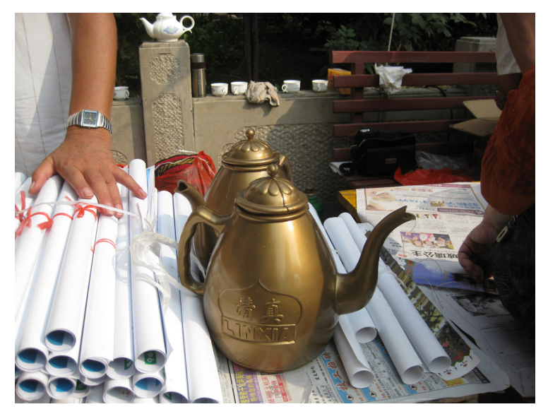
Figure 1: A plastic pitcher being sold outside the Great South Mosque of Jinan. It is dyed golden to mimic a metal tincture. The metal tinge is, however, not a necessary attribute on a pitcher, as many are simply green or brown and only have a simple plastic finish, as demonstrated in Figure 2.