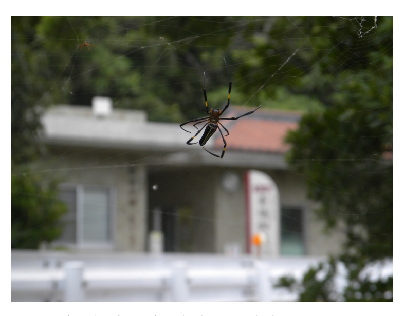
Figure 7: Sēfa Utaki is famous for its biodiversity, and is home to numerous species of spiders and insects. In the background is the entrance building, Midori no Yakata Sēfa.

erates. In some cases, World Heritage listings have done more harm than good, contributing to unbridled mass tourism that has led to the destruction of the very places and cultures UNESCO was supposed to preserve. This applies especially to small historical towns and rural areas, which may change overnight as a result of the sudden advent of mass tourism. 15 For a site such as Sēfa Utaki, 400,000 visitors per year (i.e., several thousand per day during high season) constitute a significant burden, and local authorities and residents are busy discussing possible measures to reduce this number. I have already mentioned the suggestion to reintroduce the ban on men, which would presumably lead to a reduction of about fifty percent in visitor numbers. Perhaps more realistic is the suggestion to fix a maximum number of visitors per day—once that number has been reached, no more entrance tickets can be sold.