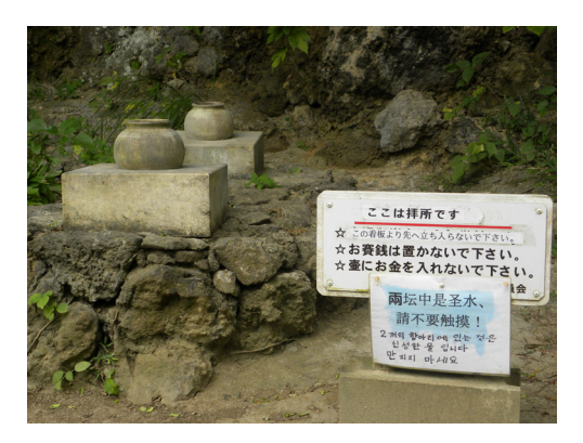
Figure 4: The shikiyodayuru and amadayuru sacred jugs. A sign tells visitors not to enter the sacred area or throw coins into the jugs. Provisional signs in Chinese and Korean have recently been added, pointing to the recent increase in visitors from other East Asian countries.

This became clear to me when I witnessed a conflict between two Okinawan women, engaged in a private ritual, and some tourists, at this particular spot. The women were probably yuta : Okinawan spirit mediums, hired by individuals to discover and solve the spiritual causes (e.g., dissatisfied ancestral spirits) of problems they experience in their daily lives. Most yuta are women, but there are also male yuta . In recent years, some have adapted the Japanese habit of referring to themselves as "spiritual counsellors" ( supirichuaru kaunserā ) who are providers of "spiritual care" (Hamasaki 2011; cf. Gaitanidis 2011). Yuta should not be confused with noro ; while the latter engage in ritual ceremonies on behalf of a community and are not paid for their services, yuta are individual practitioners who operate in a spiritual market, and their status in Okinawan society is much more ambivalent. Although I did not have the opportunity to talk to these women, they did appear to be yuta : one of them conducted the ritual and experienced some sort of communion with the deity, while the other acted as her mentor, sitting next to her