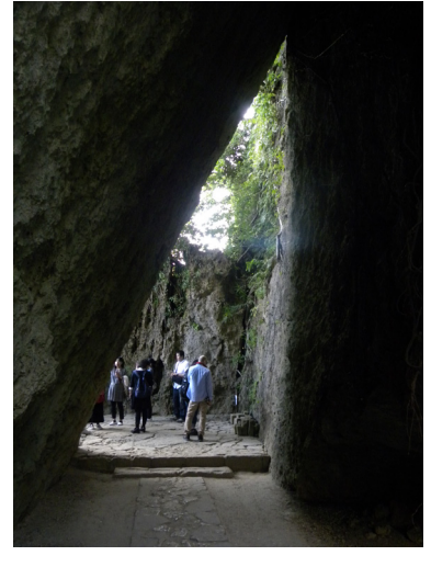
Figure 5: The sangūi worship site. In the background, a group of tourists admire the view of Kudakajima Island.