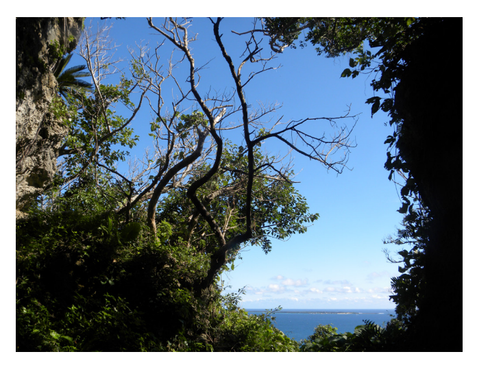
Figure 6: View of Kudakajima Island from behind the sangūi.

and supporting her. As Hamasaki Morihasa has explained, when a person makes the choice to become a yuta (often middle-aged women who have overcome disease or a personal crisis), she usually finds a senior yuta who becomes her mentor. Together, they visit several sacred sites in Okinawa, where they conduct prayers in order to establish good relations with the gods, until the yuta-to-be is ready to start her own business (Hamasaki, personal communication, December 2016). A visit to Sēfa Utaki would fit well within such a training program.