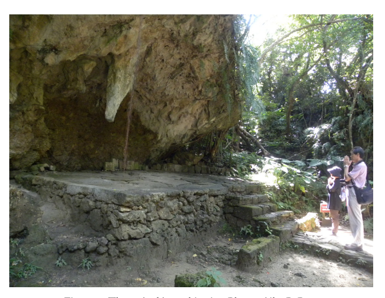
Figure 3: The yuinchi worship site.

Returning on the same path, then turning left before reaching the ufugūi , visitors come to another clearing next to a high rock with two stalactites. The water dripping down from these stalactites is collected in two jugs, the shikiyodayuru and amaduyuru; water from these jugs was used for the purification of newly inaugurated kikoe-ōgimi. A sign in Japanese warns visitors not to touch them (apparently, this alone was not sufficient, as new provisional signs in Korean and Chinese have recently been added; see figure 4). Walking past the two jugs, one arrives at the most iconic site of Sēfa Utaki, shown in numerous guidebooks and brochures: two large rocks leaning against each other, leaving open a triangular, tunnel-like space, known as sangūi (see figure 5). On the other side of the sangūi is a small square area surrounded by rock walls, except on the east side: through an open-