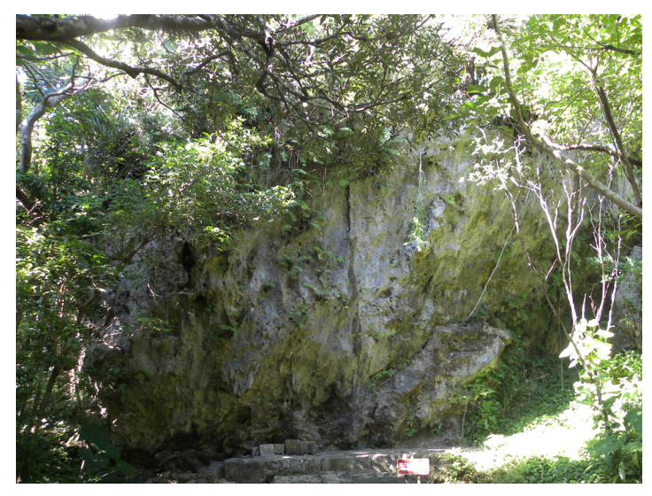
Figure 2: The ufugūi worship site.