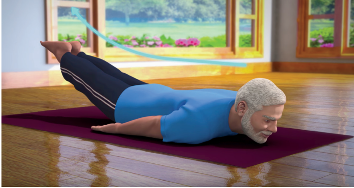
Figure 3. Yoga with Modi (Modi 2018).