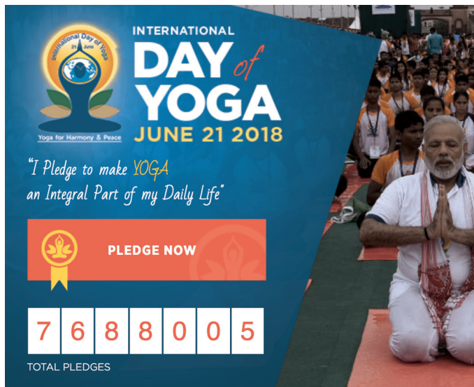
Figure 4. International Day of Yoga Pledges (Ministry of AYUSH 2018).

people are actually pledging to. It seems quite banal to pledge to make yoga an “integral part” of one’s daily life. But what does it mean, exactly? For most global yogis, this pledge is nothing more than a personal promise and cosmopolitan commitment to make the self and world better. Yet, there is much more to this. There is no coincidence or secret to the “integral” component of the pledge—at least for the insider. Two philosophers, Jacques Maritain (1936) and Deendayal Upadhyaya (1965; see Upadhyay 2017), wrote similarly titled treatises, namely “Integral Humanism.” While Maritain’s original title in French is Humanism Intégral , Upadhyaya’s Hindi title is ekātma mānav-vād (“integrated human-doctrine”). From a communal perspective they differ fundamentally; however, the general holism of integral humanist philosophy appeals to the individual concerned with globally ethical implications that result from globalization and the neo-liberal project (see Robertson 1992, 186). Globally, integral humanism is akin to a broader neo-pagan “religious environmentalism” and “Dharmic ecology” movement, which in