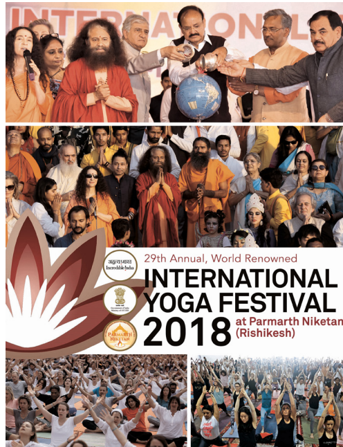
Figure 1. International Yoga Festival Poster and Baba Ramdev (Parmarth Niketan 2018).