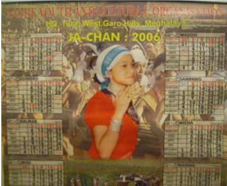
FIGURE 1. Detail from a 2006 calendar, distributed by the “Garo Youth and Cultural Organization.” The calendar shows a photo montage of a Christian Garo college student against a backdrop of Songsarek dancers (A’chik Youth and Cultural Organization, 2006).

Presently, Songsareks make up only a small portion of the Garo population. Christianity has been essential to primary education in Meghalaya, and over the past couple of decades the vast majority of the Garo have become Christians. Songsareks, or “the ones who obey the deities” ( mitde manigipa ) as they refer to themselves, only remain in a few rural pockets.