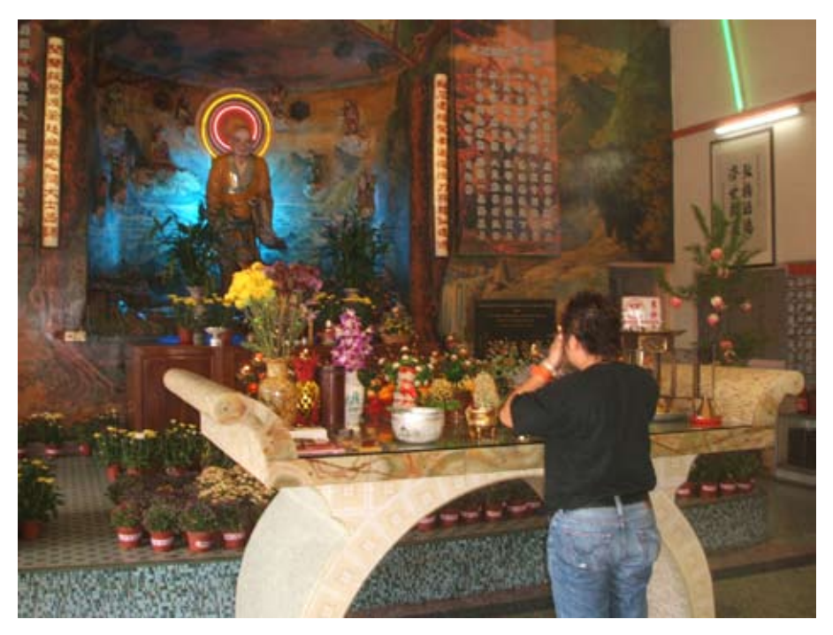
FIGURE 7. The Song Dafeng altar at Mingxiu Shanshe in Sungai Petani, Malaysia.