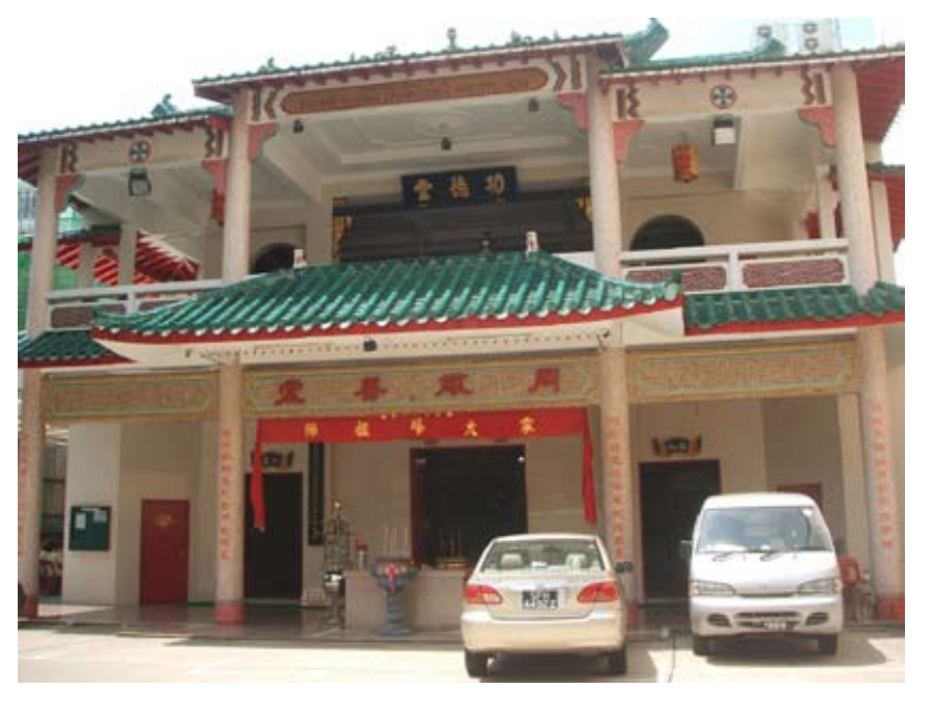
FIGURE 5. Tongjing Shantang, Singapore.