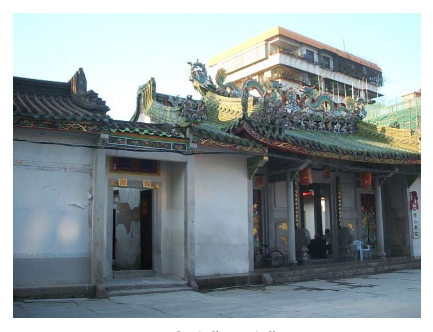
FIGURE 2. Cunxin Shantang in Shantou.