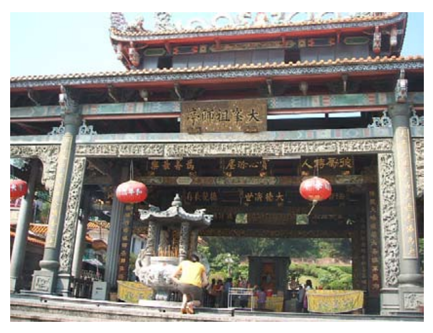
FIGURE 8. Song Dafeng pavilion in the Song Dafeng Scenic Park in Chaoyang.