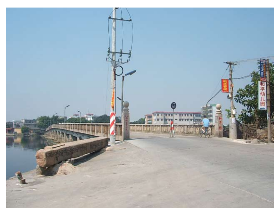
FIGURE I. Heping Bridge in Chaoyang.