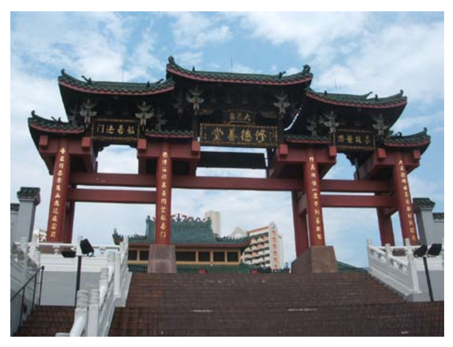
FIGURE 4. Xiude Shantang in Singapore.