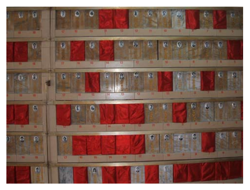
FIGURE 6. Urns at the ancestral hall in Nan'an Shantang, Singapore.

in 1975. The shantang pioneered the provision of free Western medical services in cooperation with St. Anthony's Convent (TongJing Shantang 1993, 66–67).