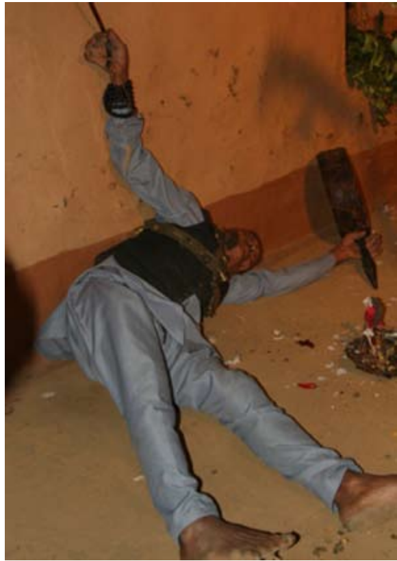
FIGURE 8. The jbākri 's body remains motionless, while his soul travels to the spirit world.