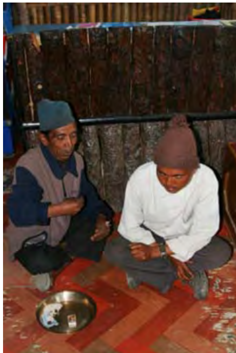
FIGURE 6. A dhāmi fumigating a patient with incense.