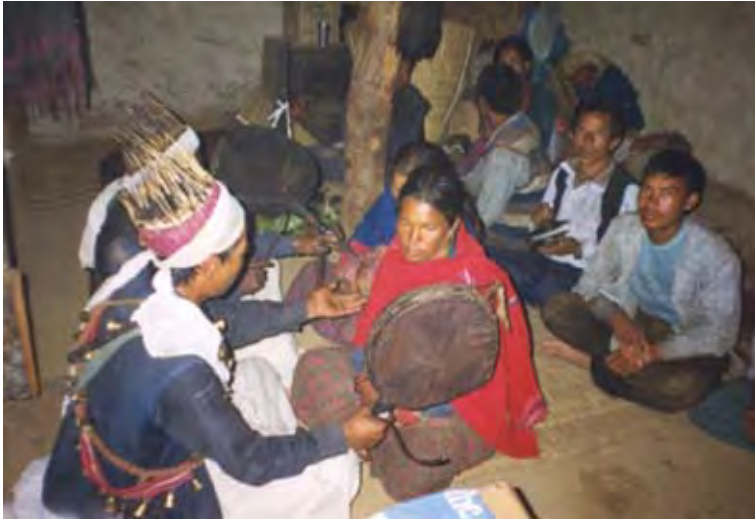
FIGURE 3. A jhākri healing ceremony.

astrologers, 3 New Age savants, and so on, could be classified as shamans. Distinct ritual practitioners are thus needlessly conflated through the use of this approach.