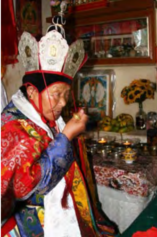
FIGURE 9. A Tibetan medium possessed by a goddess.