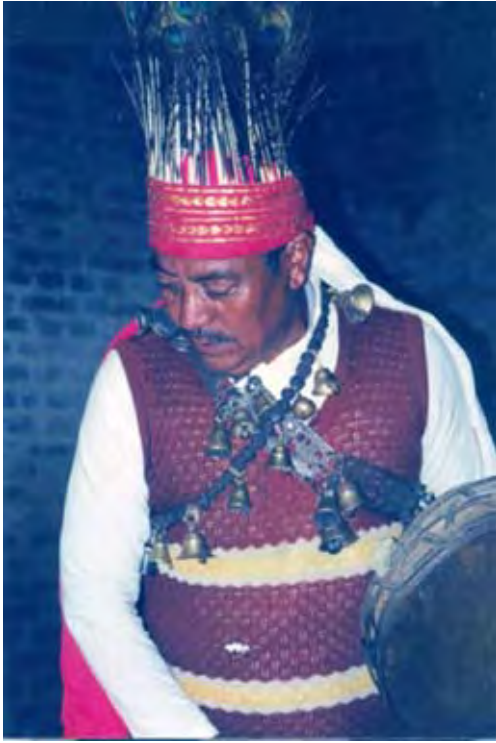
FIGURE 5. A jhākri wearing his specialized ritual costume, headdress, and bell bandolier.