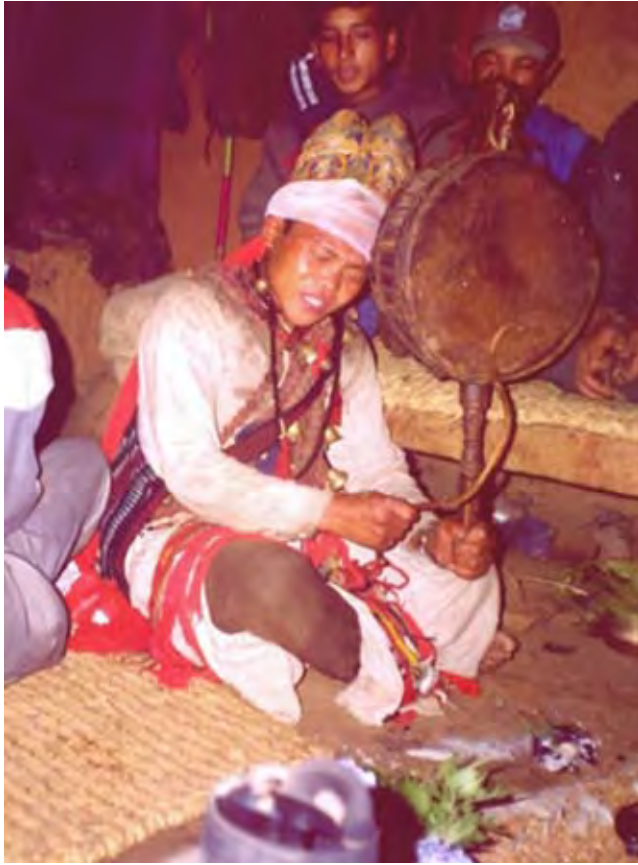
FIGURE 4. A jhākri embodying spirits.

is also problematic because Siberian shamanism did not exclude spirit possession. For instance, as the noted Russian ethnographer Sergei SHIROKOGOROFF (1923; 1924; 1935) reported, spirit possession was a central feature of Tungus shamanism: