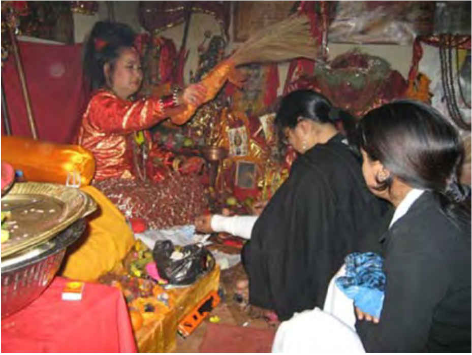
FIGURE 7. A mātā brushing an afflicted supplicant to remove evil influences.

respect to the present discussion. My ethnographic research and the ethnographic studies of other fieldworkers suggest that Nepalese shamanistic practices do display certain minor permutations within particular local cultural contexts (SIDKY 2008, 23). However, the cosmology that underlies it is a pan-Nepalese phenomenon (see ALLEN 1976a, 124 and 1976b, 514; DESJARLAIS 1989, 304; FOURNIER 1976, 118; HITCHCOCK 1976, xii; JONES 1976, 52; MACDONALD 1975, 113; MILLER 1997, 20; ORTNER 1995, 359; PAUL 1976, 145; PETERS 1981, 68; SIDKY 2008, 57–78; TOWNSEND 1997, 441). There is a remarkable unity of belief and practice even though formalized organizations of shamans are absent in Nepal (SIDKY 2008, 23). Other researchers are in agreement. For example, as MILLER (1997, 4) plainly states, these practitioners, “no matter what their ethnic group, all have a basic unity of approach to the world, a world-view, which they share in common with their patients.” Aside from the striking correspondence of beliefs and practices there are also significant similarities in the costumes, the ritual paraphernalia, and specific techniques used by shamans throughout Nepal (see SIDKY 2008, chapters 4–5).