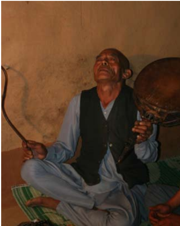
FIGURE 2. A jhākri projecting his soul into the spirit world.

RIBOLI 2000, 56–57; WATTERS 1975). According to my findings, Nepalese shamanism includes all of the specific elements that Eliade and his followers associate with “genuine” shamanism, which they consider to be exclusive to hunter-gatherer societies (WINKELMAN 2000, 71–75; 2002, 1873). These include soul journey, death-rebirth motifs, animal transformations, contact with animal spirits, communion with major deities, and hunting magic. However, although the above-mentioned elements are present in Nepalese shamanism, one of the prominent features of this tradition is spirit possession (SIDKY 2008, 59, 61; 2010; SIDKY et al., 2000). I was therefore unable to reconcile my ethnographic findings with either Eliade’s soul journey model, or Lewis’s spirit embodiment perspective.