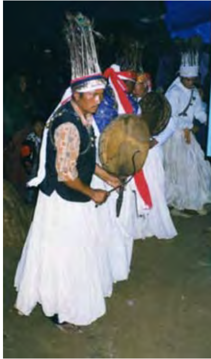
FIGURE 1. A jhākeri in full ritual garb.

ROSE and SCHOLZ 1980; CENTRAL BUREAU OF STATISTICS 2002). The majority of Nepalese subsist by farming and animal husbandry, or agropastoralism.