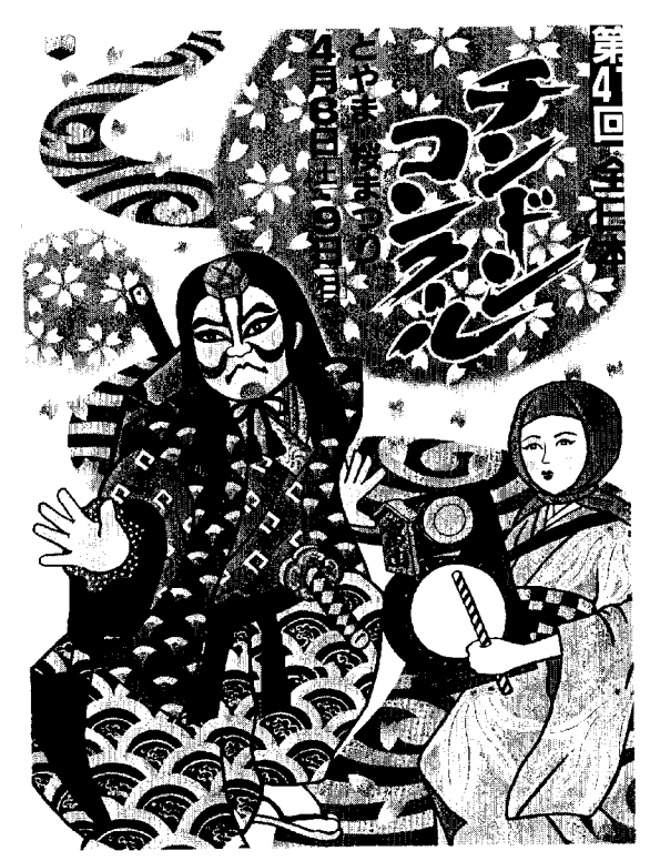
FIGURE 5. Poster of the 41st National Chindon Competition in Toyama, 1995.