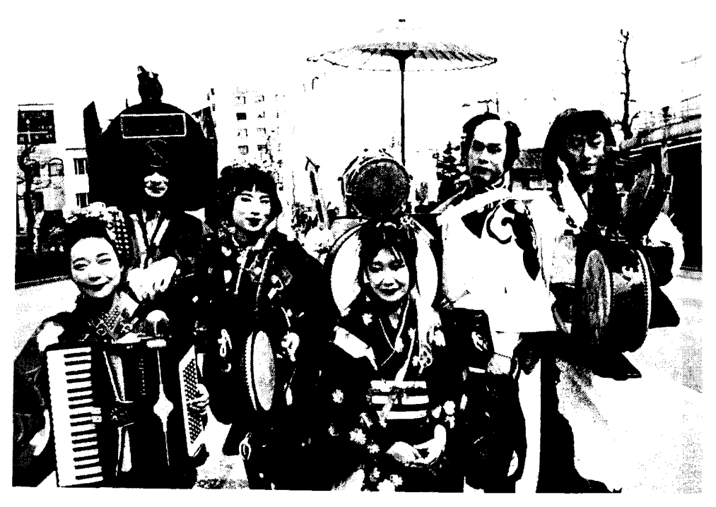
FIGURE 10. Members of the Chindon Tsushinsha and Tokyo Chindon agencies in Toyama.