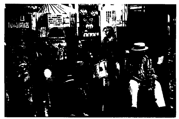
FIGURE 6. Takada Sendensha (Saitama Prefecture) in front of a pachinko parlor.