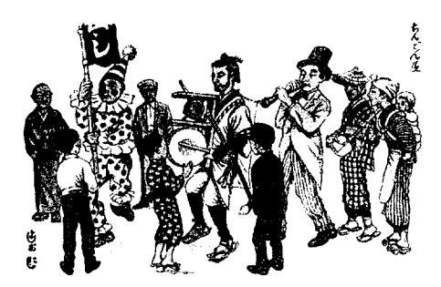
FIGURE 1. Chindonya. Drawing by Kohari Yoshio 小針美男. From the pamphlet of the National Chindon Competition in Toyama, 1990.

They parade through the streets, usually in troupes of three to five, dressed in gaudy costumes (samurai, clown, etc.), wearing sandwich boards or car-