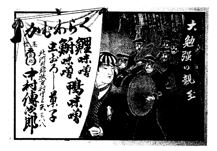
FIGURE 4. Handbill ( hikifu-da \forall | \neq L ) depicting the advertising of a music band for a miso shop in the Meiji era. From FUJIMOTO 1990, p. 27.

in the film theaters became superfluous<sup>11</sup> and many musicians turned back to the advertising business. Actors and variety hall ( yose ) artists followed suit.