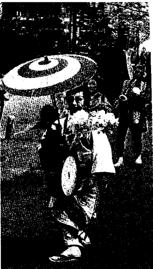
FIGURE 9. Ariga Chindon Purodakushion Kozuruya.