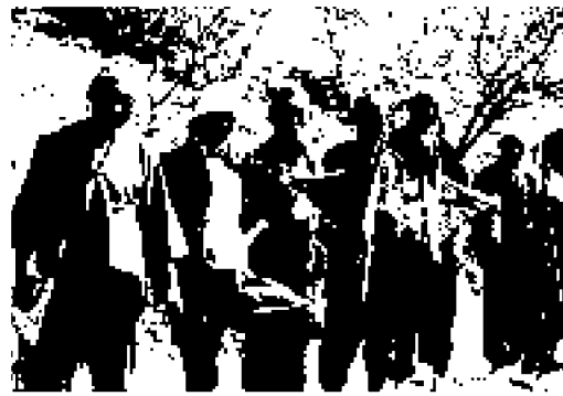
FIGURE 7. Society (guild) flags.