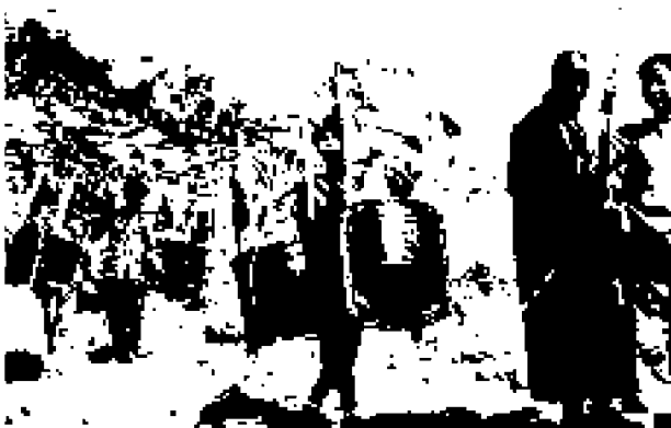
FIGURE 10. Society boxes to carry material.