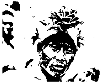
FIGURE 3. A pilgrim's hat.