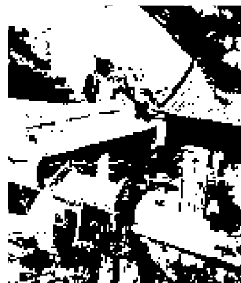
FIGURE 11. A temple courtyard.