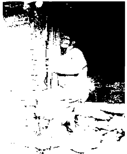
FIGURE 5. A pilgrim nailed to a temple's doorpost.