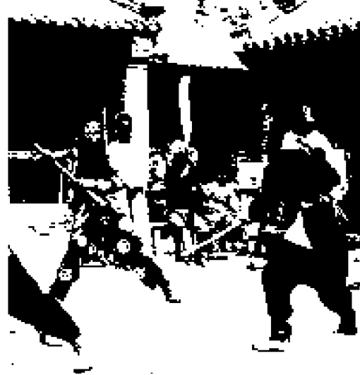
FIGURE 9. Cane dancers.