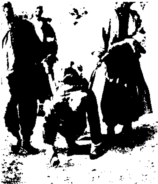
FIGURE 4. A pilgrim carrying out a vow saddled and bridled.