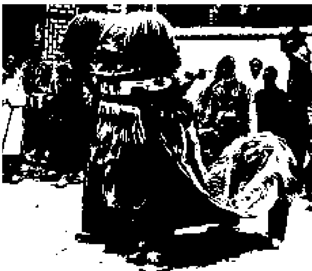
FIGURE 8. The Lion Society.