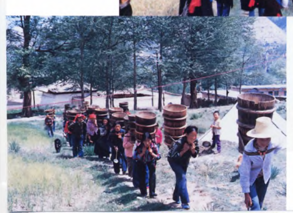
FIGURE 10. Village women carrying large wooden buckets with mutton soup for the clans camped near the village.

FIGURE 9. During the levtsi ritual the old poles are removed and taken down the mountain.