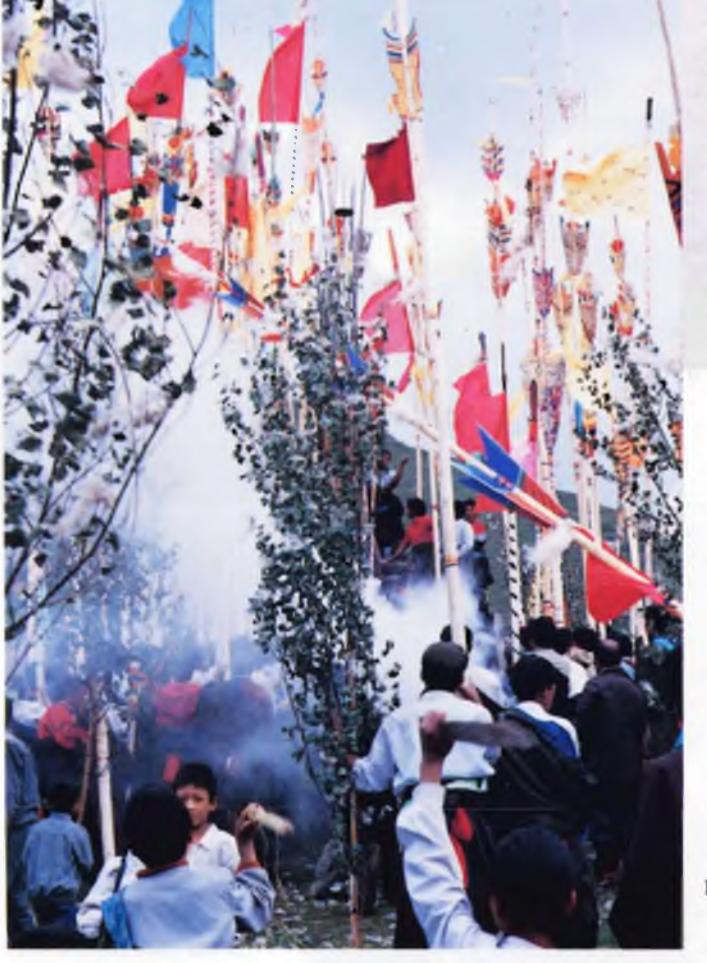
FIGURE 6. Village men dancing at the ndekheng. Note spikes on their backs and in their mouths.