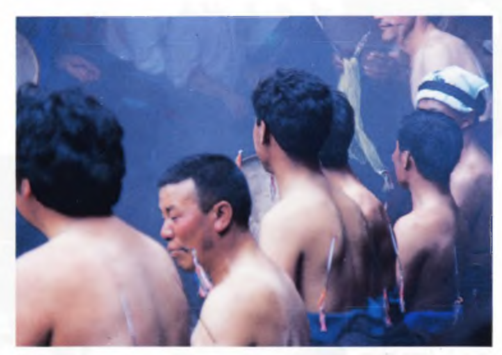
FIGURE 5. During the Laru some village men hold spikes in their mouths or stick them in their backs. Later, as they dance, the spikes fall out.