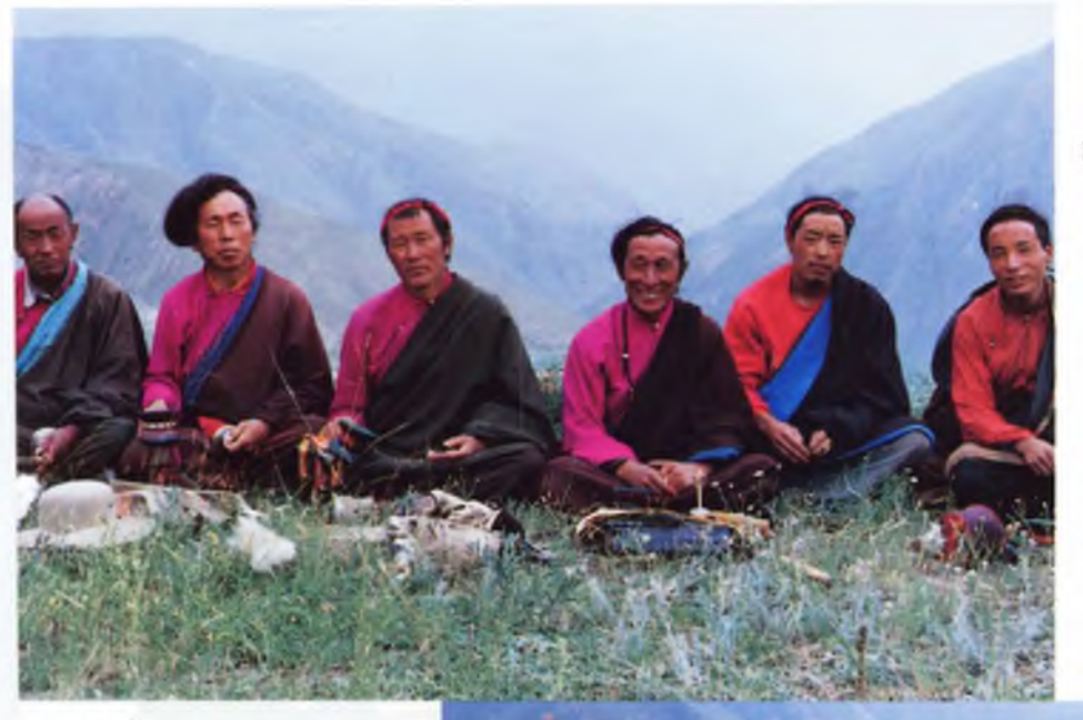
FIGURE 8. Village monks chanting during the levtsi ritual.

FIGURE 9. During the levtsi ritual the old poles are removed and taken down the mountain.