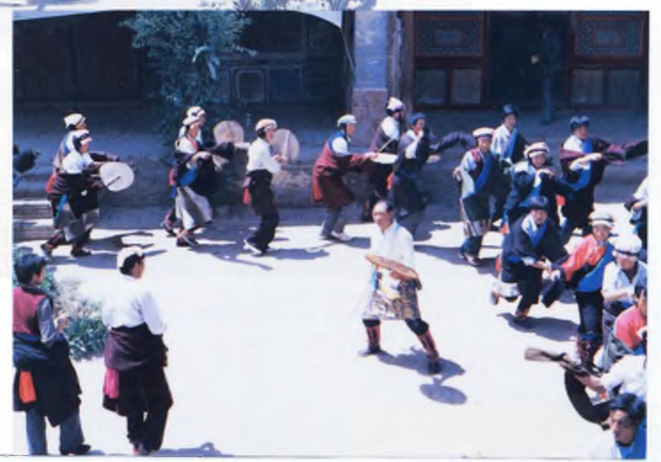
FIGURE 3. Lhave dancing at the village ndekheng (temple) in a state of possession.

FIGURE 2. The Ihawa , holding a drum, dances within a family compound during the Laru Festival.