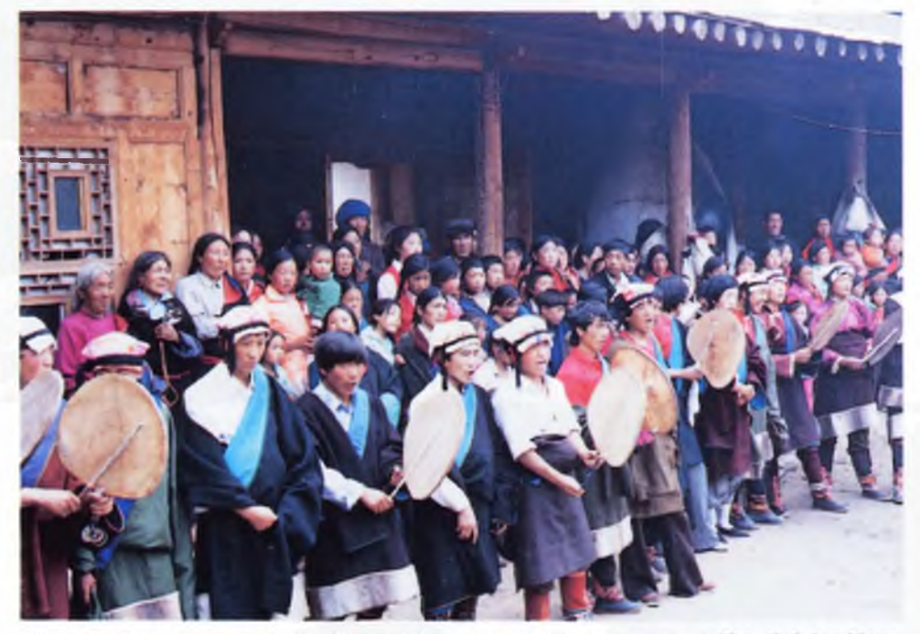
FIGURE 4. Men drumming at the village ndekheng while the lhawa is possessed. Note their headdress fixed with a queue.