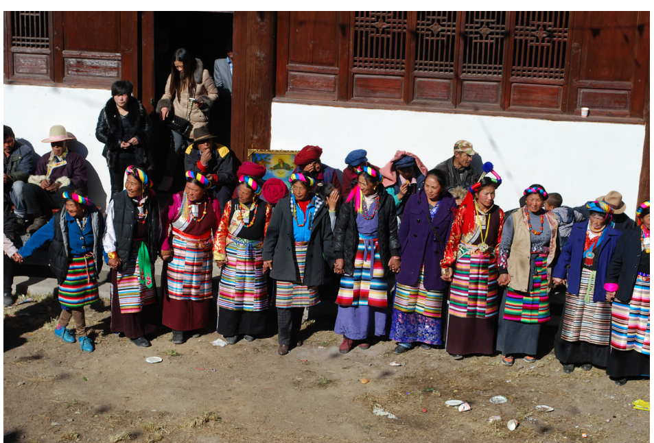
Figure 11. Village women dancing after the Christmas morning mass.

candles, a cross, and an incense censer. These activities and materials are not normally practiced and used during weekly services. The language of the mass in Cizhong is peculiar. Villagers sing many familiar Catholic songs in Tibetan using the translations originally created by the French and Swiss, using hymnals preserved by village elders and then reproduced in recent years. Conversely, the priest conducts the mass and bible readings in Mandarin Chinese, so the service is quite syncretic and eclectic, being Chinese with Tibetan chanting. Later an engaged couple walked down the aisle to receive a special Christmas blessing from the father. A procession of children in traditional Tibetan clothing and Santa hats and