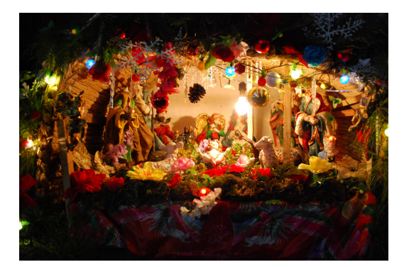
Figure 4. Crèche decoration.