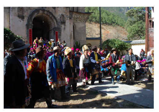
Figure 10. Village men dancing after the Christmas morning mass.