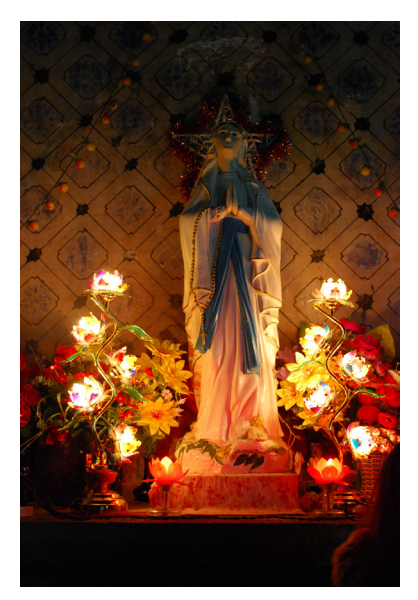
Figure 5. Virgin Mary with Tibetan-style lotus lamps.

prepared lunch for those working through the afternoon, and then everyone returned home before dusk.