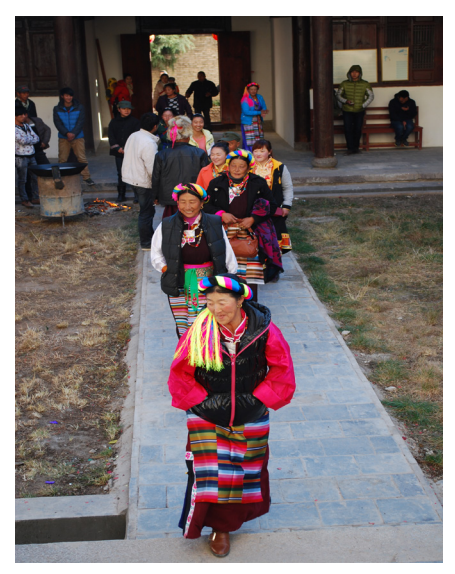
Figure 7. Villagers arriving for Christmas morning mass.

villagers but many foreigners, particularly French and Chinese tourists, photographers, and academics including myself. Christmas Eve mass continued for just under two hours, after which everyone returned home until the next morning. Both Christmas masses, and particularly the morning mass the next day, were much more extravagant than a typical Sunday service. Large numbers of villagers showed up from all over, dressed in their full traditional Tibetan regalia. As many of the other villages surrounding Cizhong also practice Catholicism yet have no permanent priest, many villagers make the trek into this village for this large annual festival to celebrate and observe their faith together.