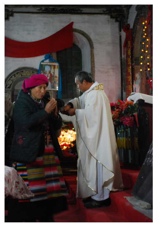
Figure 6. Priest distributing sacraments during Christmas Eve mass.