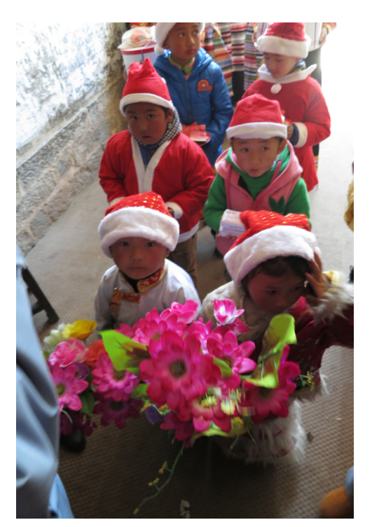
Figure 8. Children in Tibetan clothing and Santa hats during Christmas morning procession.