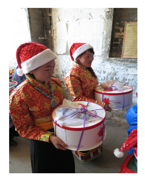
Figure 9. Village women with cake offerings for Christ during Christmas morning mass.