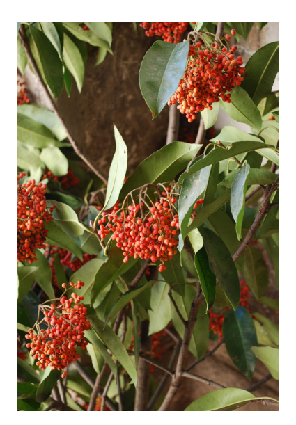
Figure 3 (left). Decoration of shengdan shu or "Christmas tree" branches.