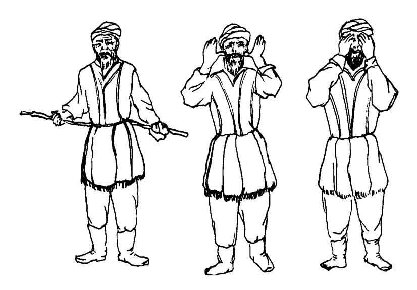
FIGURE 4. Positions of Imam Kharaman, the two to the right indicating prayer