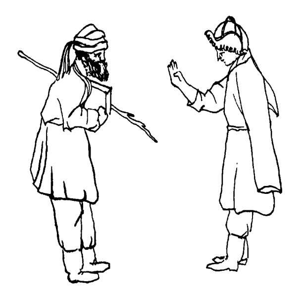
FIGURE 3. The Mongol politely greeting Imam Kharaman