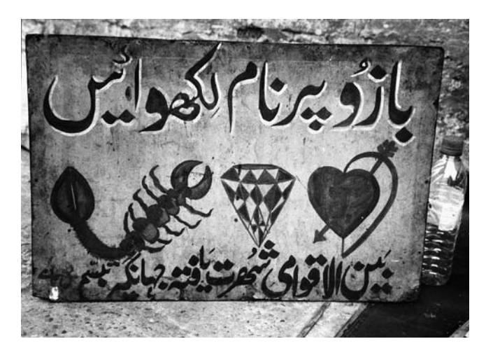
FIGURE 9. Tattooer's signboard in Lahore.

and powdered meat of the hoopoe as an antidote against scorpion bites (VENZLAFF 1994, 38, 46).