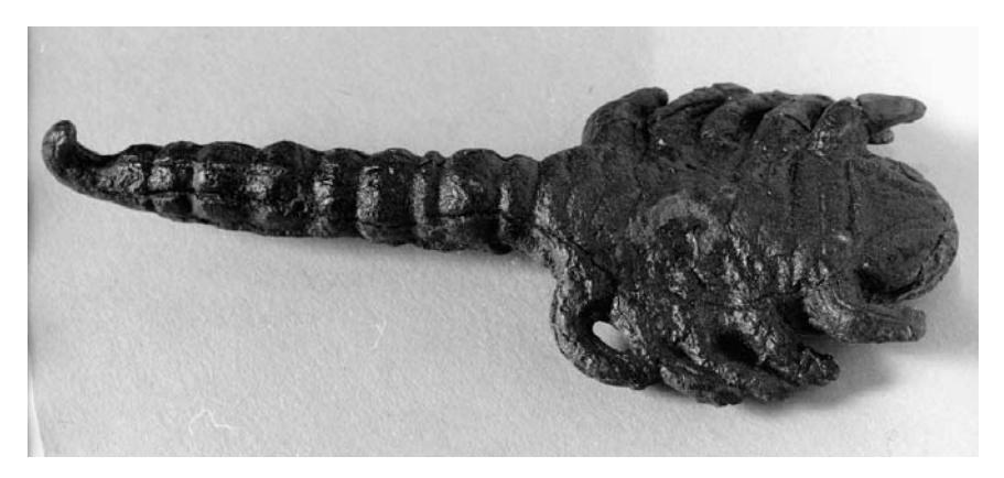
FIGURE 3: Apotropaic scorpion made of bronze (length 5-6 cm)/Ancient South Arabia.

shows a scorpion—as well as a snake, centipede, barking dog, and several weapons—attacking the eye. Eventually the scorpion also appears as a conventional Mithraic symbol: together with a snake and a dog, it helps the light and sun deity slay the bull.