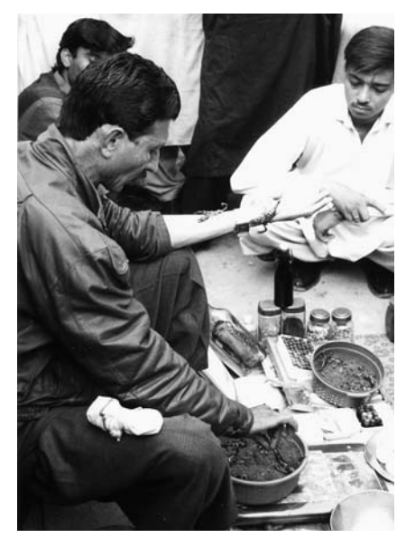
FIGURE 7. Jogi selling scorpion medicine in Peshawar (Pakistan).