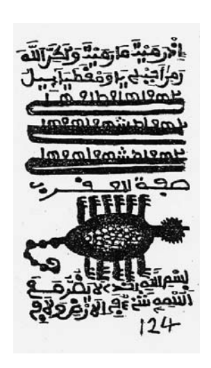
FIGURE 8. Nigerian amulet with Arabic script and the depiction of a scorpion.

scorpions and secondly, to avert the dangers emanating from the much-dreaded 'Evil Eye.' Two different ideas, with no connection to each other, form the basis for these superstitious practices. One idea, which may be traced back to pharaonic times, may have caused the emergence of scorpion goddesses. The other notion that scorpions offered protection against the 'Evil Eye,' is rooted in more recent magical beliefs that were current during the Roman period" (1983, 16). Furthermore, there are Egyptian stone amulets as well as early Islamic amulets written on paper, both with depictions of scorpions (SCHIENERL 1983, 18; GLADISS 1999, 159). A Coptic-Arabic