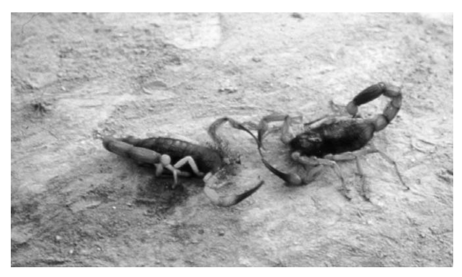
FIGURE 4. Fighting scorpions in Afghanistan.

Out of fear of the poisonous animal, the Uighurs in Eastern Turkestan