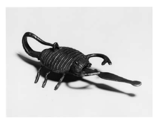
FIGURE 10. Scorpion-shaped lock from Jodhpur (Rajasthan/India).

depicting scorpions are supposed to protect the house from being entered by real scorpions as well as by scorpion-shaped demons (SCHIENERL 1984, 101–102). Similarly, women paint protective scorpions on the façades of their homes. In Palestinian embroidery, one of the patterns is called 'aqareb ("scorpion") (EL KHALIDI 1999, App. III, 133). On Near and Middle Eastern carpets, although the