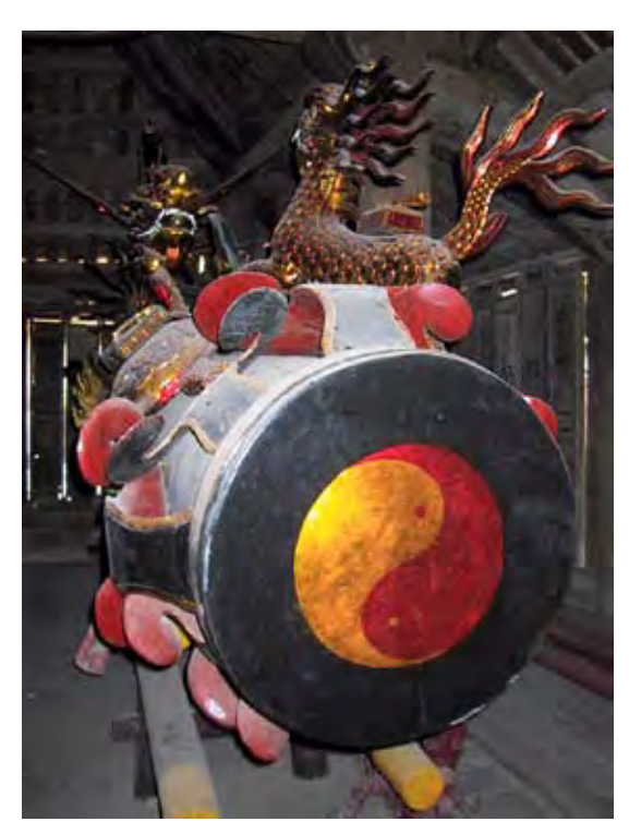
FIGURE 2. The Đồng Ky Firecracker inside the Communal House.