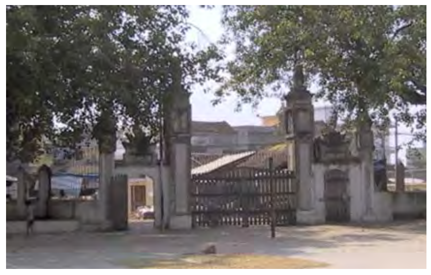
FIGURE I. Main gate to Đồng Kỵ.